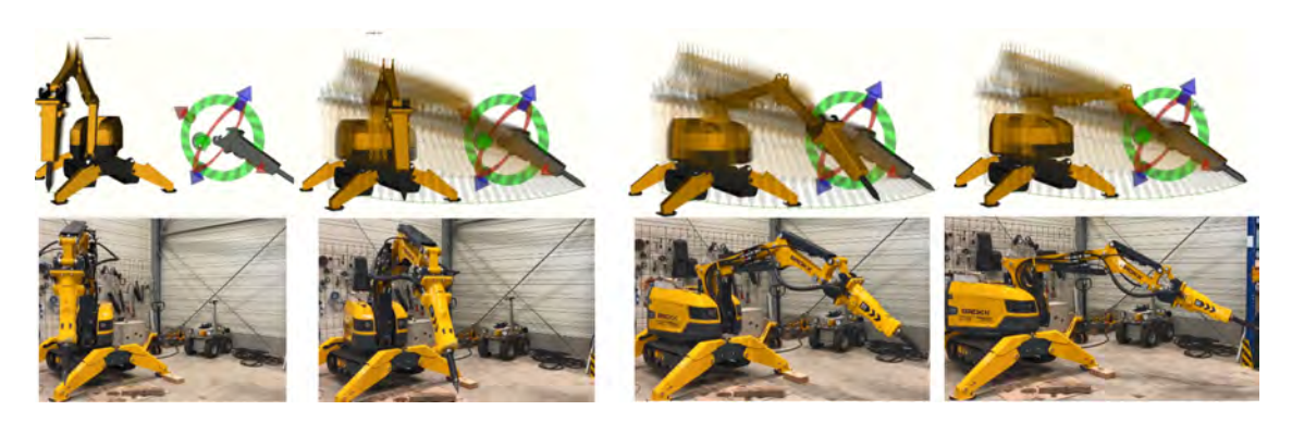
Figure 4. Snapshots of the BROKK 170 tracking a trajectory in the TCP-level. The grey tool can be interactively positioned and rotated by the operator defining the desired tool pose. According to the desired tool pose, a TCP trajectory and the corresponding joint trajectories (upper row) are generated. The joint trajectories' joint angle changes are then converted into the PWM signals to move each actuator along the desired joint trajectory (lower row).

the communication between the original input device and the machine. Based on this result, a general CLIK technique was used to convert the desired motion descriptors represented in task space to corresponding joint motions. The joint motions were then converted to CAN bus messages, which generated the corresponding PWM signals for the valve system. Instead of controlling each axis independently with the joystick, the suggested technique allowed the teleoperated machine to be programmed in task space. In the previous work, the resulting accuracy was 2 cm for the position and 0.015 rad for a point-to-point movement. Due to the nonlinearities in the hydraulic system, the error in Root Mean Square Error(RMSE) while tracking TCP path was relatively larger with 6 cm in the TCP space.