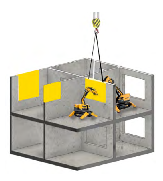
Figure 5. Conceptual visualization of the planned usecase: Top-down deconstruction approach with tower crane

to prevent the swing that might be generated when the element is dissolved from the wall. Thus, it is essential to estimate the forces applied by the first deconstruction robot to compensate them. Here, the communication between these multiple systems will be enabled in the ROS environment.